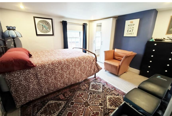
Bedroom 1 12'2" x 11'5" (3.73m x 3.49m) Fireplace feature.